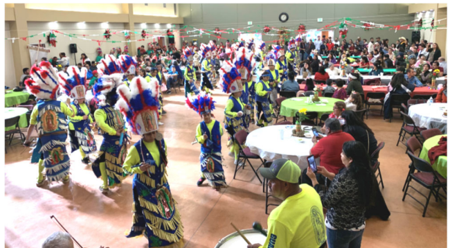
Cristo Joven celebrating the Feast of Guadalupe - Apparition of the Blessed Mother to Juan Diego.