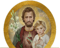
YEAR OF SAINT JOSEPH December 8, 2020 - December 8, 2021