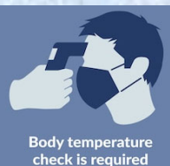
Body temperature check is required