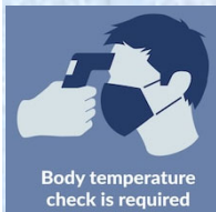
Body temperature check is required