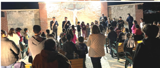
March 9, 2022 in the Prayer Garden