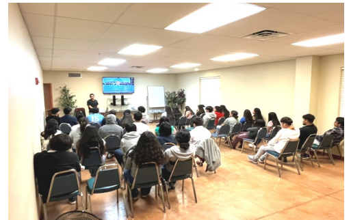
Teens help set up Taste of St. Matthews for the community of St. Matthew.